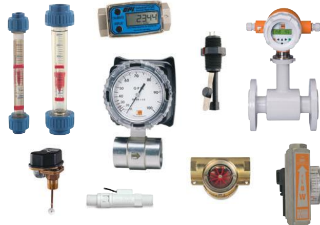
Meters, Switches, Transmitters, Indicators