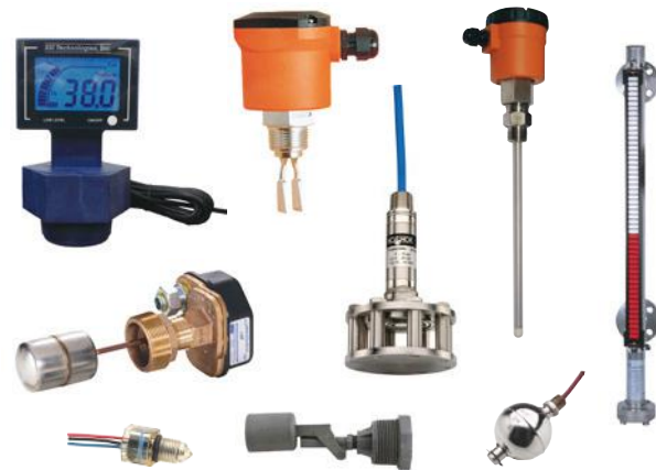
Transmitters, Switches, Indicators