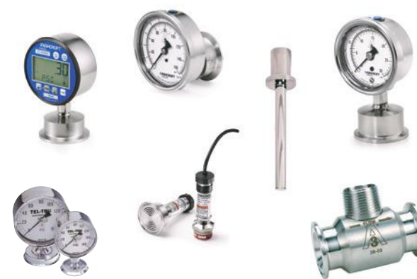
Gauges, Transducers, Flow Meters, Switches, Thermometers, Thermowells