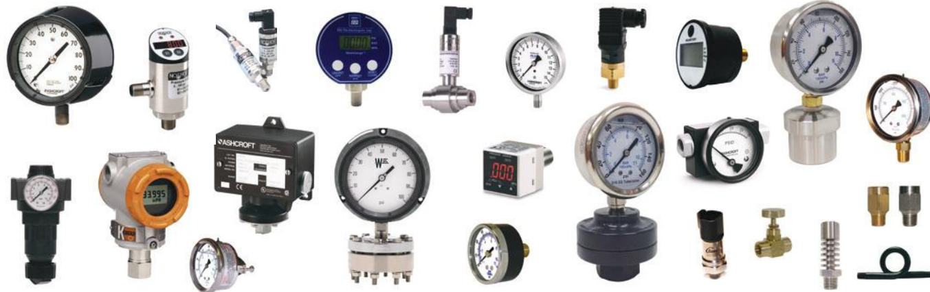
Gauges, Transducers/Transmitters, Switches, Digital Gauges, Diaphragm Seals, Differential, Regulators/Filters/ Lubricators, Accessories