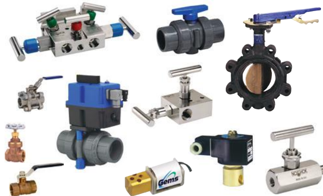
Solenoid Valves, Plastic Valves, Ball Valves, Butterfly Valves, Gate Valves, Globe Valves, Actuated Valves, Check Valves, Needle Valves, Manifold Valves, Safety Relief Valves