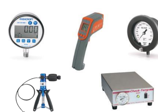
Test Gauges, Digital Test Gauges, Deadweight Tester, Temperature Calibrators, Infrared Non-Contact Thermometers