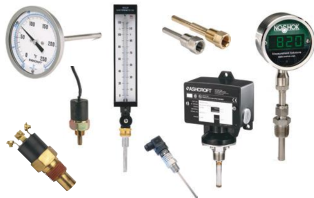
Thermometers, Transducers/Transmitters, Switches, Digital Thermometers, RTDs/Thermocouples, Thermowells