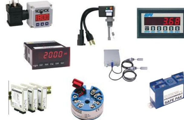
Digital Displays & Meters, I/O Equipment & Electronics, Pump Controllers, Batch Controllers