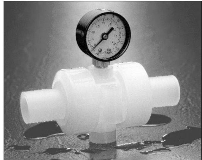
GGMU above, shown with Schedule 80 male spigot ends for fusion (Code C3 below) and optional 2" gauge.

Note: 1/4" NPT instrument connection is standard on all Ultra-Pure gauge guards. For other size requirements consult factory.